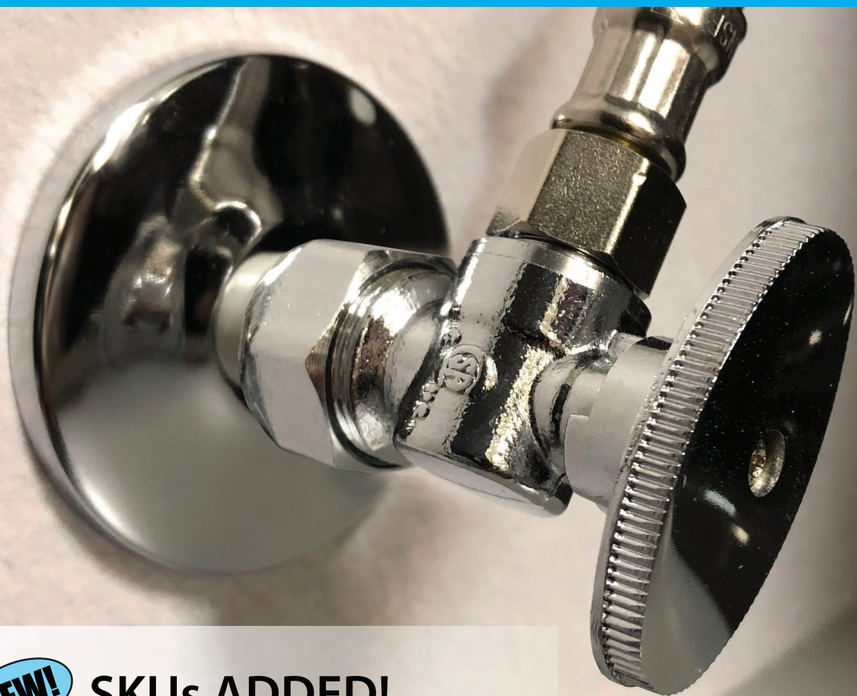
S10311 pictured above